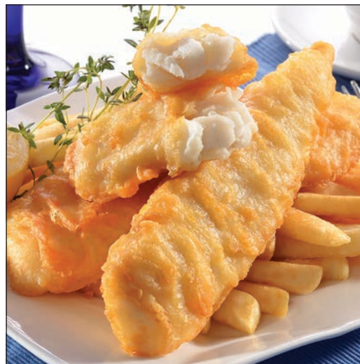
9325 Beer Battered Cod