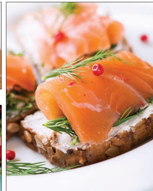
6985 Smoked Salmon