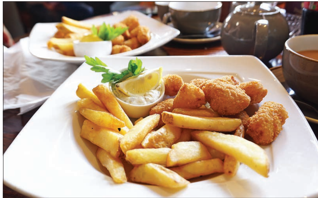
7949 Wholetail Scampi