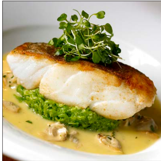
7805 Cod Loins