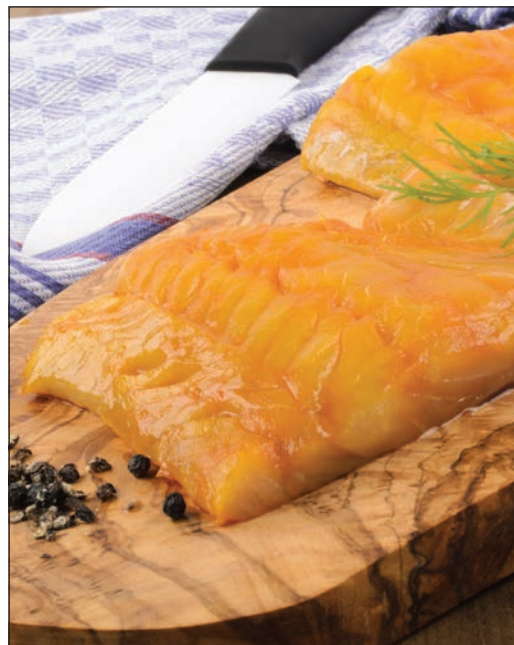
7526 Smoked Haddock Fillets