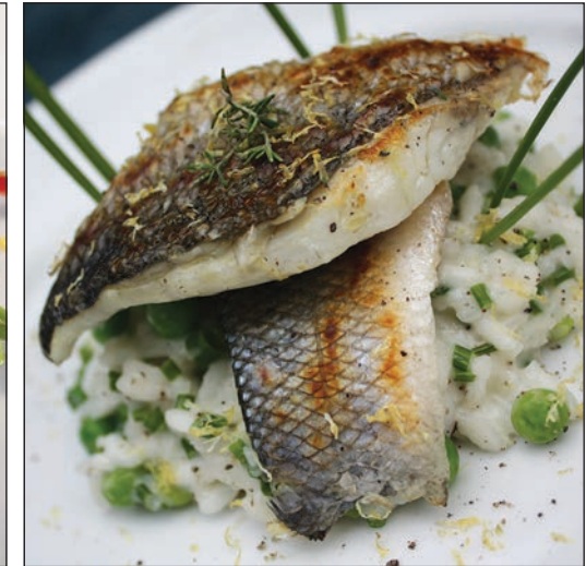
4440 Seabass Fillets