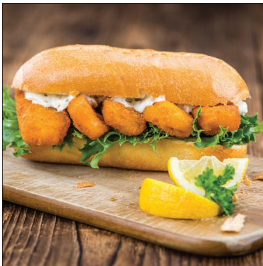
5544 Fish Fingers