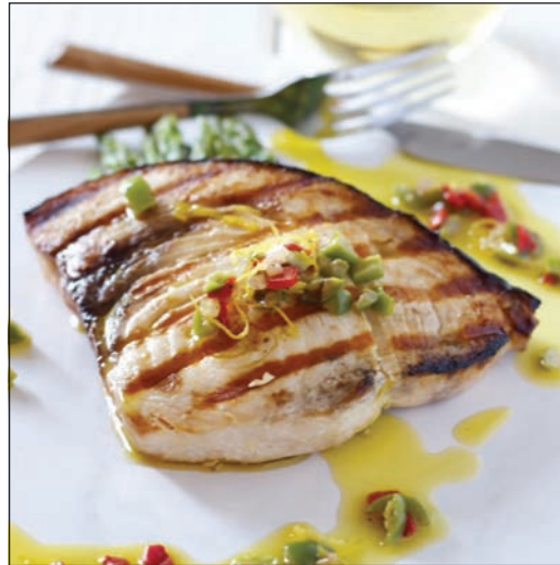
1742 Swordfish Loins