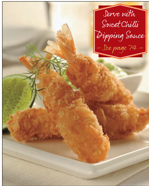
6832 Panko Breaded Torpedo Prawns