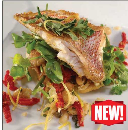
7768 Red Snapper Fillet