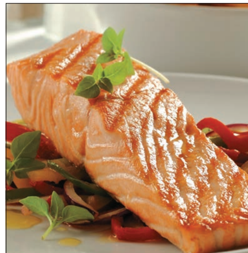
3378 Salmon Fillet Supreme